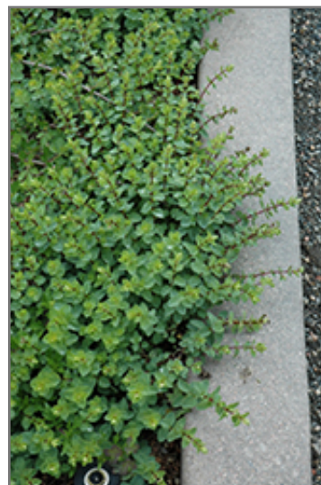
Lebanese Oregano