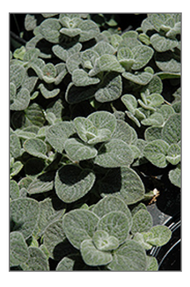
Dittany Of Crete foliage

An ornamental variety with arching stems that produce interesting round leaves that are very wooly with some purple mottling; rose-pink flowers in summer with rose-purple bracts that persist; excellent color and texture for a rock garden or border front