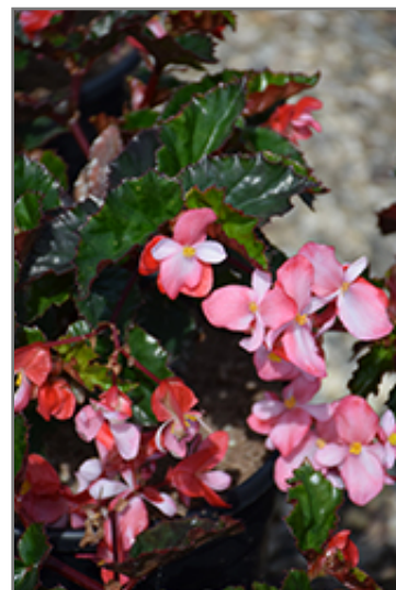
Richmond Begonia flowers

Richmond Begonia is recommended for the following landscape applications;