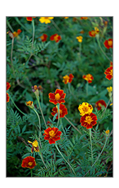
Burning Embers Marigold flowers

Burning Embers Marigold will grow to be about 12 inches tall at maturity, with a spread of 12 inches. When grown in masses or used as a bedding plant, individual plants should be spaced approximately 10 inches apart. Its foliage tends to remain dense right to the ground, not requiring facer plants in front. This fast-growing annual will normally live for one full growing season, needing replacement the following year.