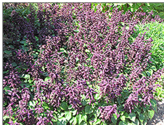
Vista Purple Sage in bloom