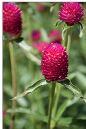
Qis Carmine Gomphrena flowers

Qis Carmine Gomphrena is recommended for the following landscape applications;