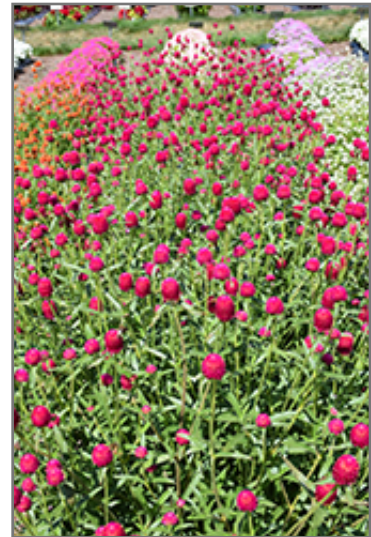
Qis Carmine Gomphrena in bloom

Qis Carmine Gomphrena is a fine choice for the garden, but it is also a good selection for planting in outdoor pots and containers. With its upright habit of growth, it is best suited for use as a 'thriller' in the 'spiller-thriller-filler' container combination; plant it near the center of the pot, surrounded by smaller plants and those that spill over the edges. Note that when growing plants in outdoor containers and baskets, they may require more frequent waterings than they would in the yard or garden.