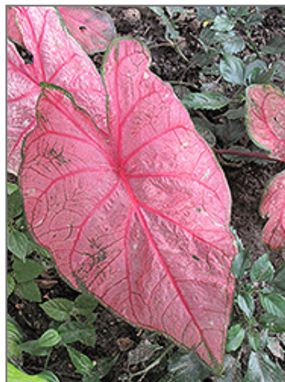
Fannie Munson Caladium foliage

Fannie Munson Caladium is recommended for the following landscape applications;