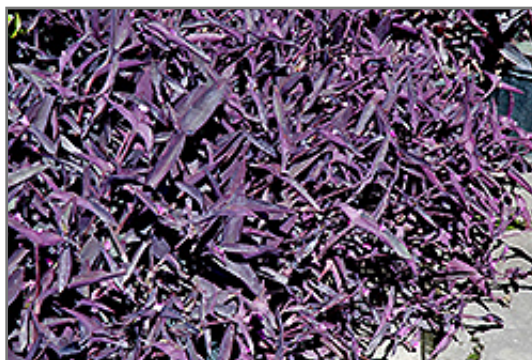
Purple Queen foliage

Purple Queen is recommended for the following landscape applications;