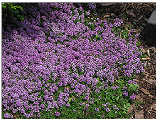
Purple Carpet Creeping Thyme in bloom