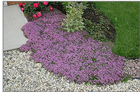
Red Creeping Thyme in bloom