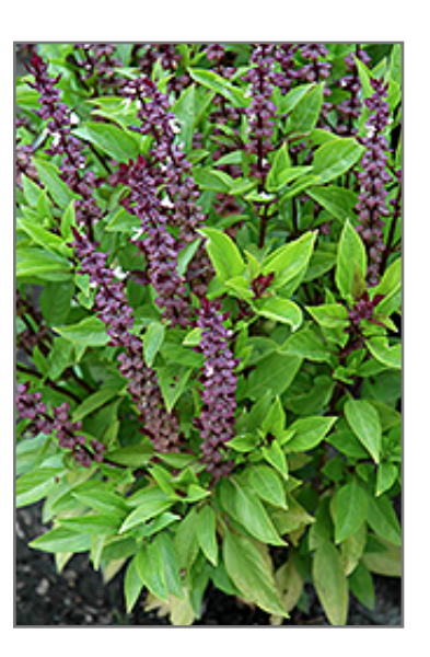
Queen Of Sheba Basil flowers

A very ornamental variety with huge purple flower spikes in mid summer; medium-green leaves have a mild flavor; great for mixed containers. herb gardens, and annual beds