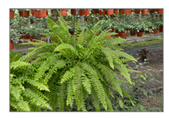
Australian Sword Fern in full

Australian Sword Fern is recommended for the following landscape applications;