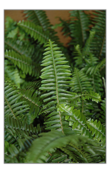
Australian Sword Fern foliage