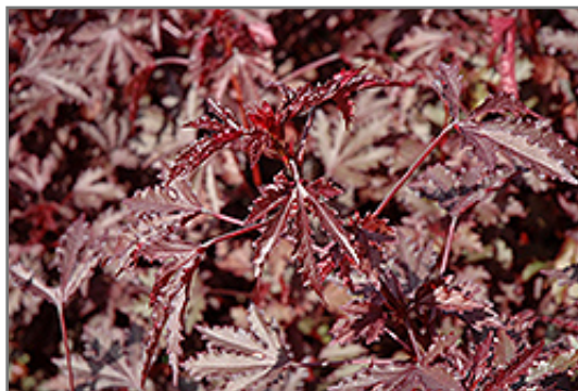
Haight Ashbury Hibiscus foliage