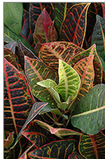
Variegated Croton foliage