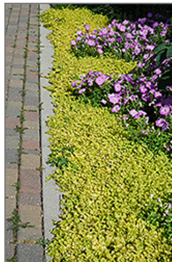
Golden Creeping Jenny