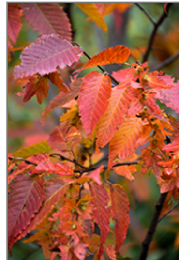
Firespire American Hornbeam in fall