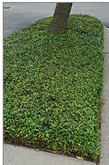
Asian Jasmine