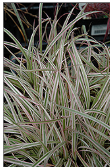
Cherry Sparkler Fountain Grass foliage

Cherry Sparkler Fountain Grass is recommended for the following landscape applications;