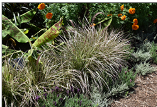
Cherry Sparkler Fountain Grass