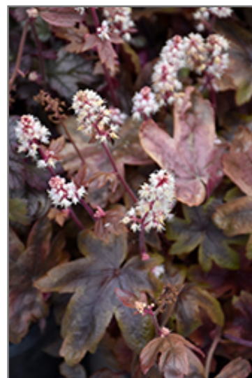
Brass Lantern Foamy Bells flowers