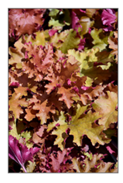
Zipper Coral Bells foliage

Zipper Coral Bells is a dense herbaceous evergreen perennial with tall flower stalks held atop a low mound of foliage. Its relatively fine texture sets it apart from other garden plants with less refined foliage.