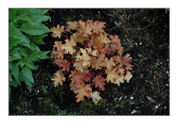
Zipper Coral Bells

This is a relatively low maintenance plant, and should be cut back in late fall in preparation for winter. It is a good choice for attracting hummingbirds to your yard. It has no significant negative characteristics.