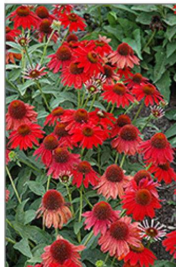
Sombrero Salsa Red Coneflower flowers

Sombrero Salsa Red Coneflower is recommended for the following landscape applications;