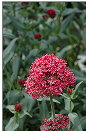
Red Valerian flowers