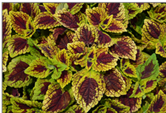
Stained Glassworks Raspberry Tart Coleus foliage