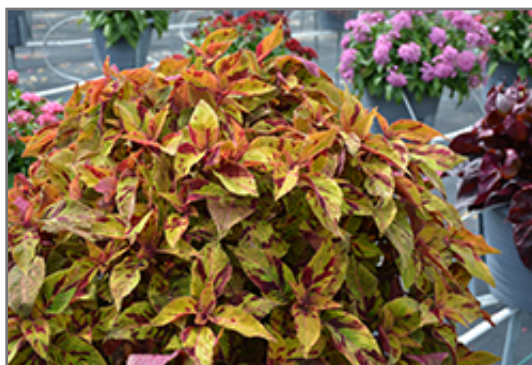
Premium Sun Mighty Mosaic Coleus