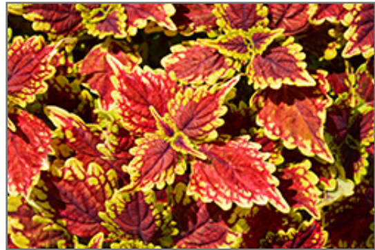
Oxford Street Coleus foliage