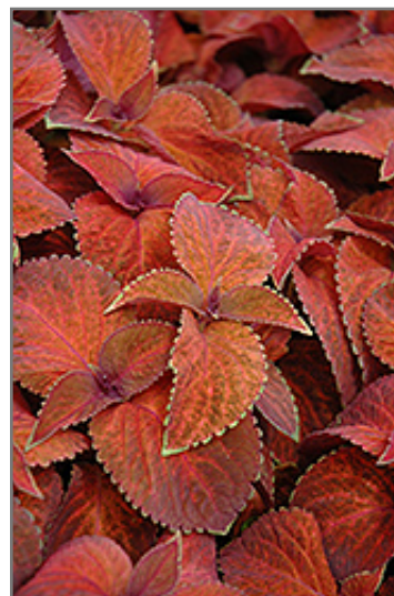
Wizard Sunset Coleus foliage

Wizard Sunset Coleus is recommended for the following landscape applications;