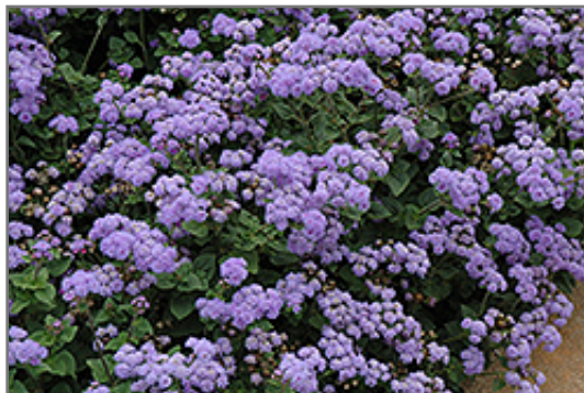
High Tide Blue Flossflower in bloom

High Tide Blue Flossflower is a fine choice for the garden, but it is also a good selection for planting in outdoor containers and hanging baskets. It is often used as a 'filler' in the 'spiller-thriller-filler' container combination, providing a mass of flowers against which the thriller plants stand out. Note that when growing plants in outdoor containers and baskets, they may require more frequent waterings than they would in the yard or garden.