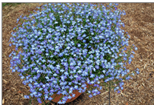
Bella Cielo Lobelia in bloom