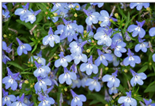
Techno Upright Light Blue Lobelia flowers

Techno Upright Light Blue Lobelia is recommended for the following landscape applications;