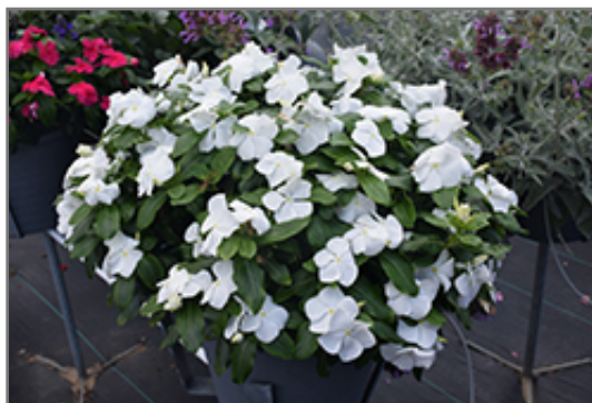
Titan Pure White Vinca in bloom

Titan Pure White Vinca is a fine choice for the garden, but it is also a good selection for planting in outdoor containers and hanging baskets. It is often used as a 'filler' in the 'spiller-thriller-filler' container combination, providing a mass of flowers against which the thriller plants stand out. Note that when growing plants in outdoor containers and baskets, they may require more frequent waterings than they would in the yard or garden.