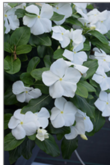
Titan Pure White Vinca flowers

Titan Pure White Vinca is recommended for the following landscape applications;