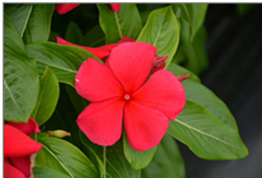
Titan Dark Red Vinca flowers

Titan Dark Red Vinca is recommended for the following landscape applications;