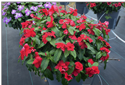
Titan Dark Red Vinca in bloom

Titan Dark Red Vinca will grow to be about 14 inches tall at maturity, with a spread of 12 inches. Its foliage tends to remain dense right to the ground, not requiring facer plants in front. Although it's not a true annual, this fast-growing plant can be expected to behave as an annual in our climate if left outdoors over the winter, usually needing replacement the following year. As such, gardeners should take into consideration that it will perform differently than it would in its native habitat.