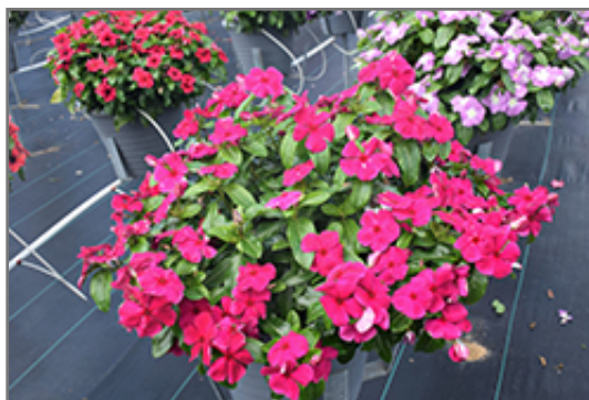
Titan Burgundy Vinca in bloom