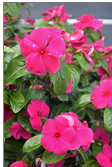
Titan Burgundy Vinca flowers

Titan Burgundy Vinca is a fine choice for the garden, but it is also a good selection for planting in outdoor containers and hanging baskets. It is often used as a 'filler' in the 'spiller-thriller-filler' container combination, providing a mass of flowers against which the thriller plants stand out. Note that when growing plants in outdoor containers and baskets, they may require more frequent waterings than they would in the yard or garden.