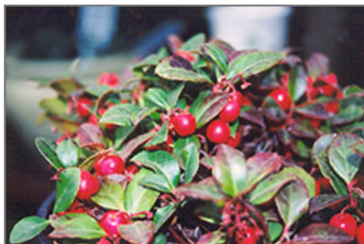
Creeping Wintergreen fruit

Creeping Wintergreen is recommended for the following landscape applications;