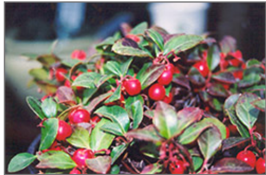
Creeping Wintergreen fruit

Creeping Wintergreen is recommended for the following landscape applications;