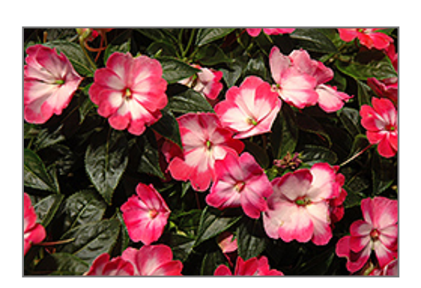
Harmony Radiance Pink New Guinea Impatiens flowers

Harmony Radiance Pink New Guinea Impatiens is recommended for the following landscape applications;