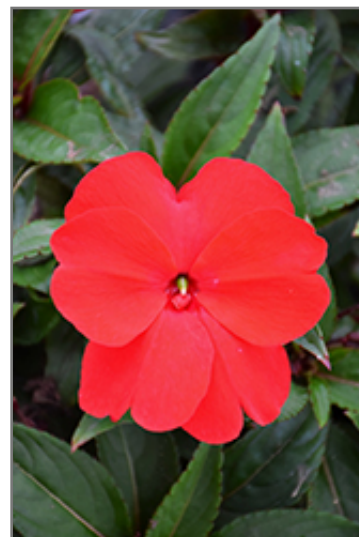
Florific Red New Guinea Impatiens flowers

Florific Red New Guinea Impatiens is recommended for the following landscape applications;