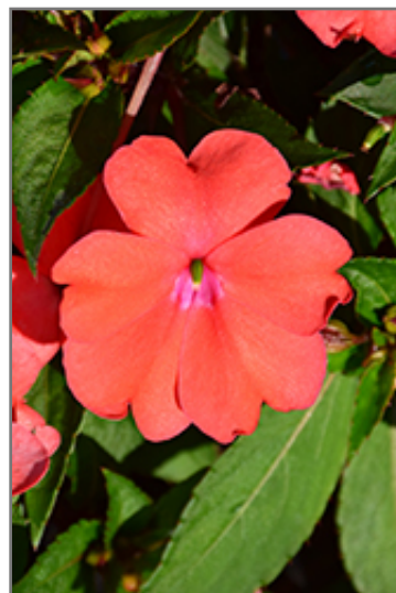
SunPatiens Spreading Corona New Guinea Impatiens flowers

SunPatiens Spreading Corona New Guinea Impatiens is recommended for the following landscape applications;