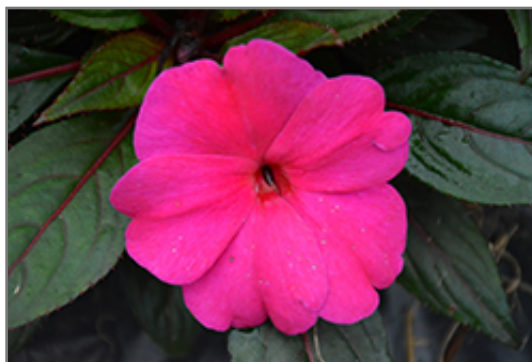
Magnum Blue New Guinea Impatiens flowers

Magnum Blue New Guinea Impatiens is recommended for the following landscape applications;