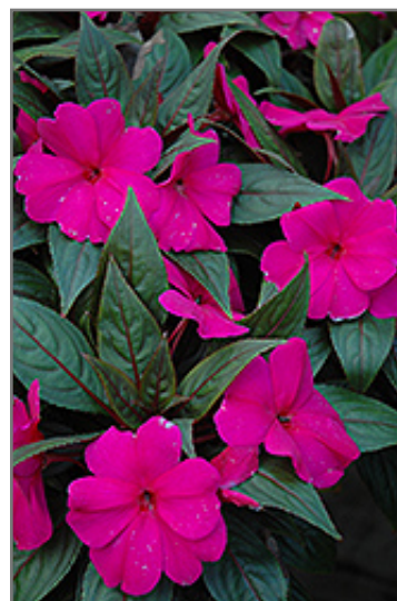
Magnum Blue New Guinea Impatiens flowers