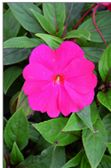
Divine Violet New Guinea Impatiens flowers

Divine Violet New Guinea Impatiens is recommended for the following landscape applications;