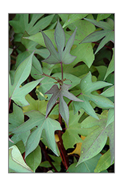
Desana Compact Red Sweet Potato Vine foliage

Desana Compact Red Sweet Potato Vine will grow to be about 18 inches tall at maturity, with a spread of 7 feet. Its foliage tends to remain dense right to the ground, not requiring facer plants in front. This fast-growing annual will normally live for one full growing season, needing replacement the following year.