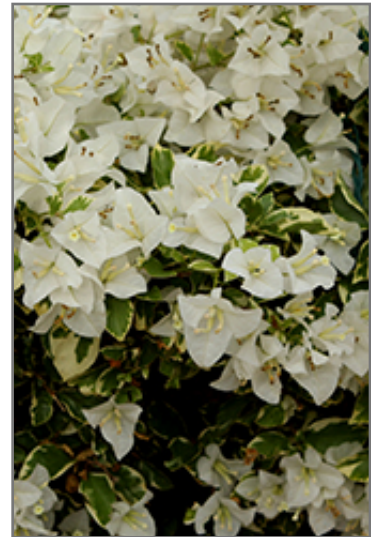
White Stripe Bougainvillea flowers