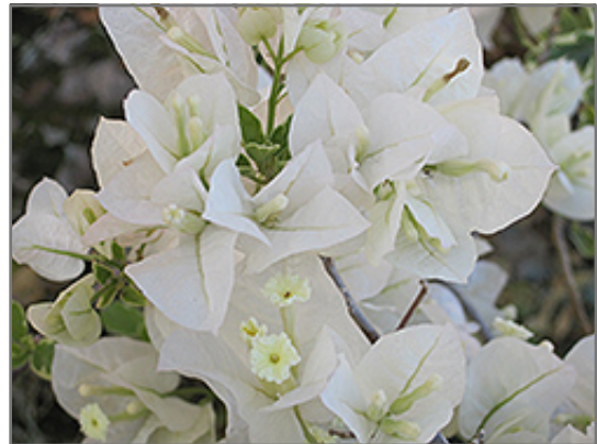
White Stripe Bougainvillea flowers