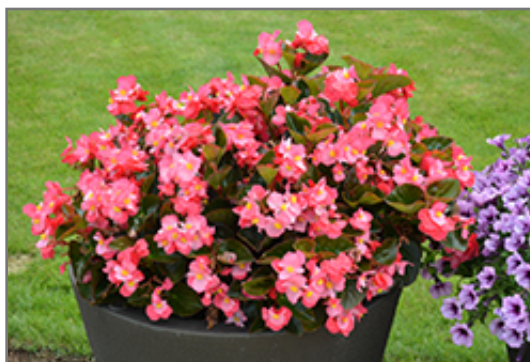
Surefire Rose Begonia in bloom