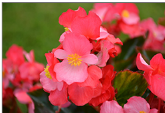
Surefire Rose Begonia flowers

Surefire Rose Begonia is an herbaceous annual with an upright spreading habit of growth. Its medium texture blends into the garden, but can always be balanced by a couple of finer or coarser plants for an effective composition.