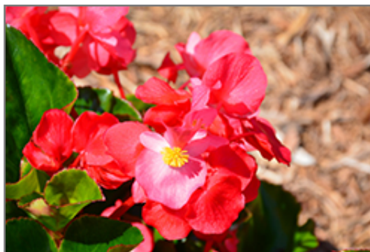
Whopper Rose Green Leaf Begonia flowers

This is a high maintenance plant that will require regular care and upkeep, and usually looks its best without pruning, although it will tolerate pruning. Deer don't particularly care for this plant and will usually leave it alone in favor of tastier treats. Gardeners should be aware of the following characteristic(s) that may warrant special consideration;