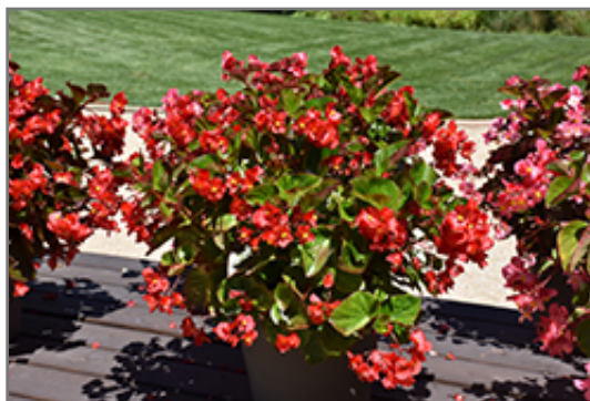
Whopper Red Green Leaf Begonia flowers