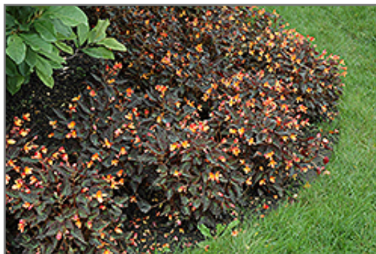
Sparks Will Fly Begonia in bloom