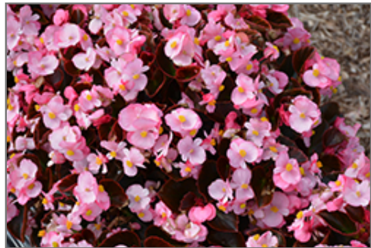
Nightife Pink Begonia flowers