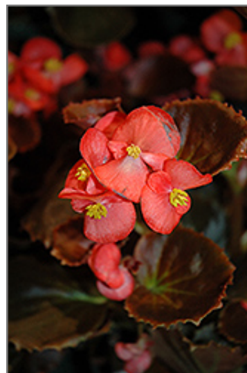
Nightife Red Begonia flowers

This is a high maintenance plant that will require regular care and upkeep, and usually looks its best without pruning, although it will tolerate pruning. Deer don't particularly care for this plant and will usually leave it alone in favor of tastier treats. Gardeners should be aware of the following characteristic(s) that may warrant special consideration;