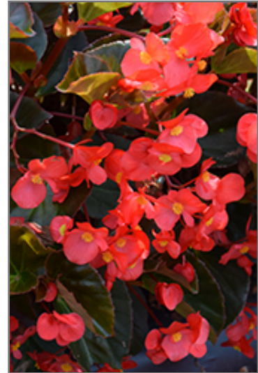
Big Red Bronze Leaf Begonia flowers

Big Red Bronze Leaf Begonia is a fine choice for the garden, but it is also a good selection for planting in outdoor containers and hanging baskets. It is often used as a 'filler' in the 'spiller-thriller-filler' container combination, providing a mass of flowers and foliage against which the larger thriller plants stand out. Note that when growing plants in outdoor containers and baskets, they may require more frequent waterings than they would in the yard or garden.