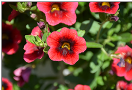
Superbells Pomegranate Punch Calibrachoa flowers