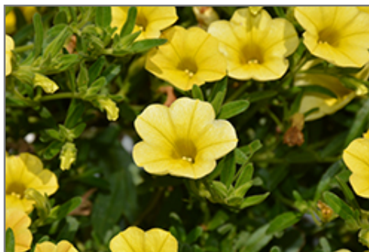
Million Bells Trailing Yellow Calibrachoa flowers

Million Bells Trailing Yellow Calibrachoa is a dense herbaceous annual with a trailing habit of growth, eventually spilling over the edges of hanging baskets and containers. Its medium texture blends into the garden, but can always be balanced by a couple of finer or coarser plants for an effective composition.