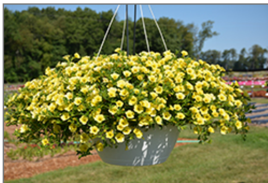
Million Bells Trailing Yellow Calibrachoa in bloom

Million Bells Trailing Yellow Calibrachoa is a fine choice for the garden, but it is also a good selection for planting in outdoor containers and hanging baskets. Because of its trailing habit of growth, it is ideally suited for use as a 'spiller' in the 'spiller-thriller-filler' container combination; plant it near the edges where it can spill gracefully over the pot. It is even sizeable enough that it can be grown alone in a suitable container. Note that when growing plants in outdoor containers and baskets, they may require more frequent waterings than they would in the yard or garden.