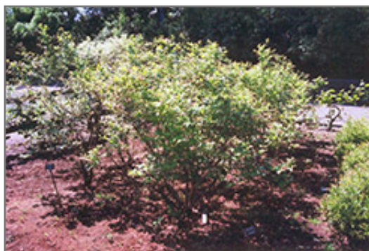
Northland Blueberry