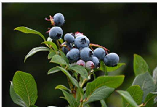
Northland Blueberry fruit